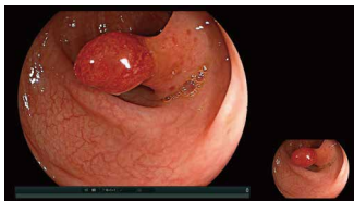
Full HD monitor

Captured image is displayed without overlapping with the real-time view when a full HD wide monitor is used.